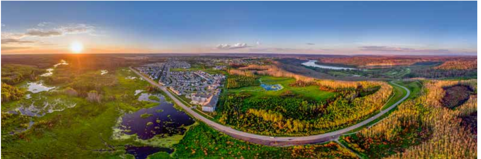
"New Beginnings"